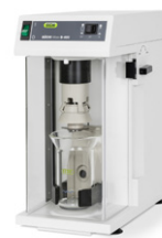
Mixer B-400 Grinding and homogenization