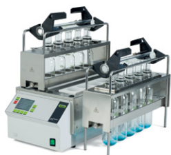
SpeedDigester K-439 / K-425 / K-436 IR digestion