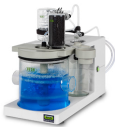
Scrubber K-415 Neutralization