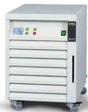
Recirculating Chiller F-108 The efficient way of cooling