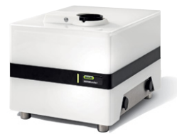
NIRMaster™ IP54 FT-NIR spectroscopy with ingress protection