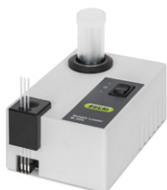
Sample Loader M-569 Efficient packing of capillaries