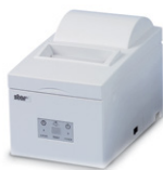
Star Printer Serial printer