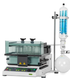
Syncore® Polyvap Multiple sample workup