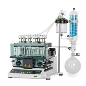
Syncore® SPE Parallel concentration and solid phase extraction