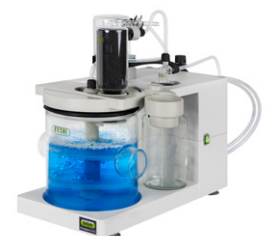
Scrubber K-415 Neutralization

"The SpeedDigester is the ideal tool for dealing with medium sample loads for both TKN and heavy metal determinations."