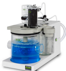
Scrubber K-415 Neutralization