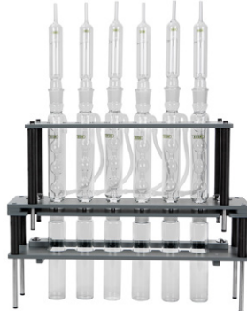
Trace metal and hydroxyproline (using water reflux condensers)