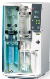
Distillation Units K-350 / K-355 Steam distillation