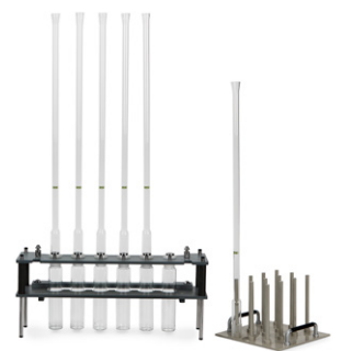
Chemical oxygen demand (using air reflux condensers)