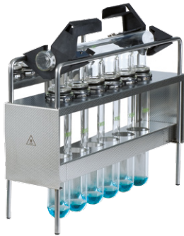
Nitrogen and protein (Kjeldahl)

Compose your SpeedDigester solution according to your specific needs: