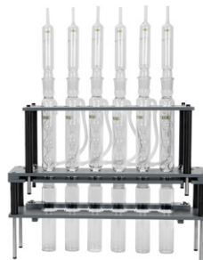
Reflux Setup Water or air reflux