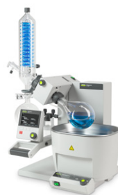
Rotavapor® R-300 Convenient and efficient rotary evaporation