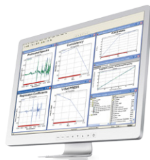
NIRCal® Software Chemometric calibration development