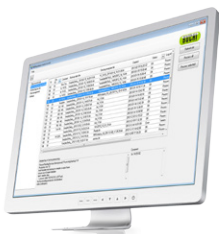
NIRAnywhere Software Network solution