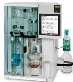
KjelMaster K-375 Steam distillation and titration