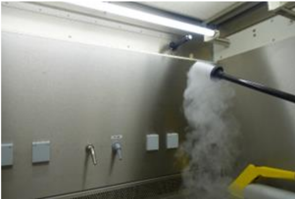
Discharge of the fog with the help of the one spot probe of CFG 291.

The fog of the CFG 291 can be released either via the outflow probe (simple, punctual release) or via a distribution rake (multiple, punctual release).