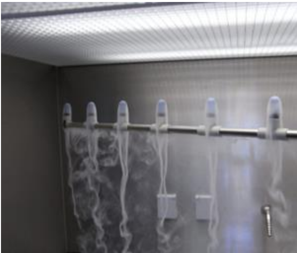
Discharge of the fog with the help of the CFG 291 distribution rake.

The generated fog is highly visible and has a sufficiently high durability to allow photo or video documentation of the air flow.